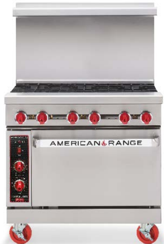
Model AR-6C Shown with optional casters and convection base oven.

The Heavy Duty Restaurant Range Series by American Range was designed for continuous rugged use and performance. All the latest technology is incorporated to give you the best value for your money.